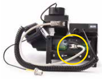
4. Connect the D-sub connector and the antenna cable.