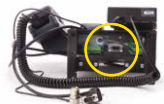
2. Undo antenna cable and D-sub connector.