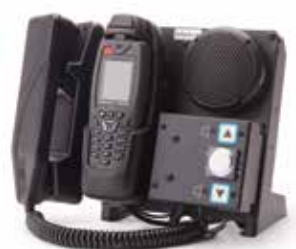
1. Remove the old TiGR35R holder and its bracket.