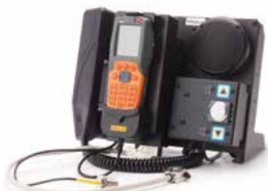
3. Mount the bayonet bracket for the Cradle kit SED.